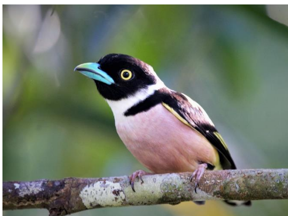
Black-and-yellow Broadbill