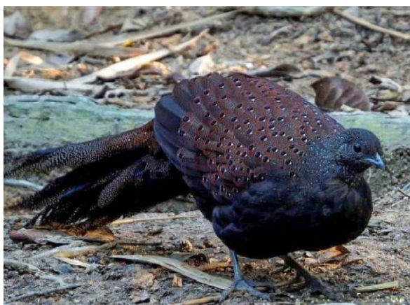
Mountain Peacock-pheasant, photographed on our February 2019 visit to Bukit Tinggi

Rising early, we will have a quick snack and drive to an area near the Japanese Garden, then walk out to a viewing area in readiness for two 'five-star' birds. Over the past few years, birders visiting Bukit Tinggi have been able to see the highly sought-after Mountain Peacock-pheasant and richly coloured Ferruginous Partridge. Whilst both are normally very elusive and hardly ever seen, here they often come to a feeding area here and show off their splendour! We have a good chance of seeing both before returning for a late breakfast and our drive to Taman Negara.