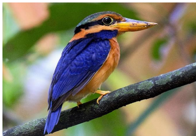
Rufous-collared Kingfisher is one of the species we hope to see at Taman Negara

Weather Tropical climate. Although hot and humid (28-35°C/ 82-95F) in the lowlands, for much of the time we will be in the shade of the forest. Generally cooler and more pleasant early and late in the day, and in the highlands at Fraser's Hill (15-25C/59-77F), falling to below 10C/50F at night). February/March is the 'dry season' but rainfall can and does occur year round in the rainforest, particularly during the afternoons at Fraser's Hill.