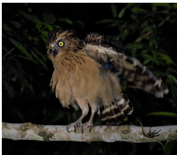
Buffy Fish Owl is one of the species we will hope to find in the early days of our trip