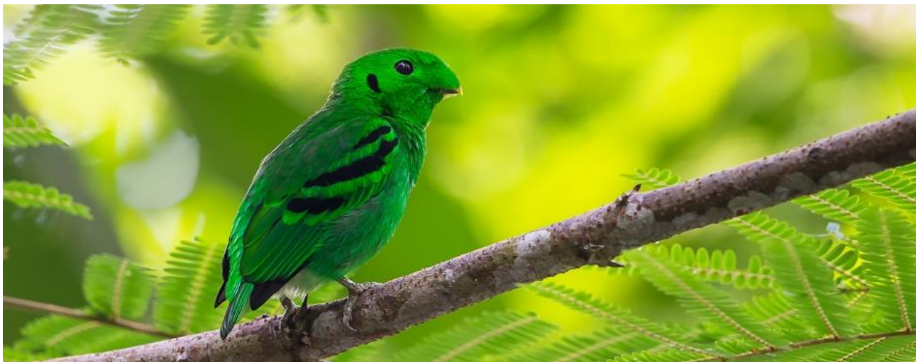
Green Broadbill is one of the stunning birds we will hope to find at Taman Negara