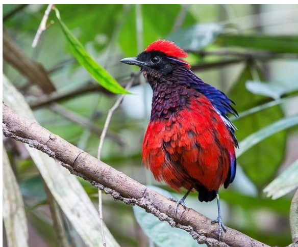
Garnet Pitta is one of the amazing species we will hope to find at Taman Negara